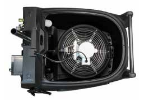
Lightweight atomizer/fan for easy one person set-up and break-down